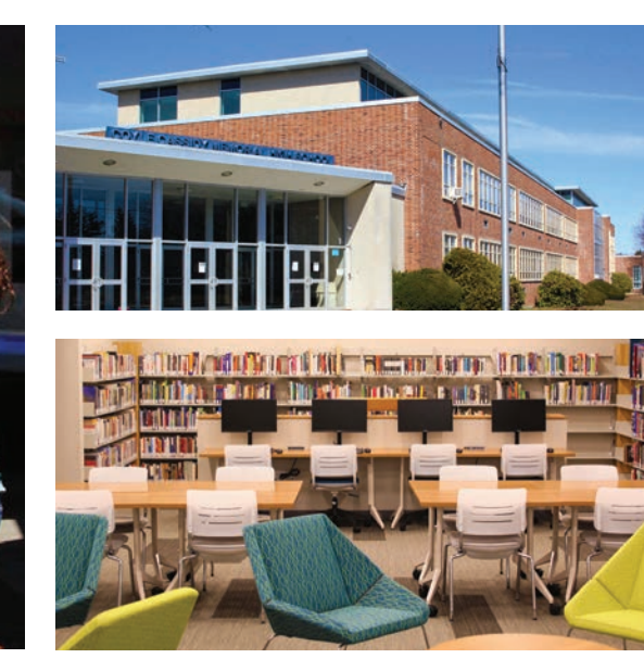
Top to Bottom: New Taunton Center building. Attleboro Learning Commons

The campus has a full-service Enrollment Center with admissions, advisement, and financial aid counselors as well as academic support services and the most modern computer labs available. Free parking for students is available in two nearby parking garages.