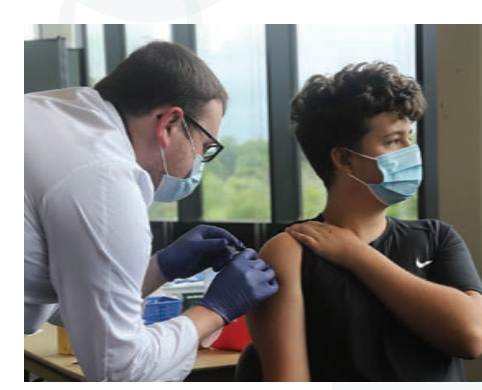
Children 12 to 18 years old took advantage of one of the first public vaccination clinics for their age group.

In partnership with a Stop & Shop Pharmacy, the family-friendly event, coordinated by 36 volunteers, offered to-go foods and ice cream, a raffle, giveaways and gift cards to everyone who was vaccinated.