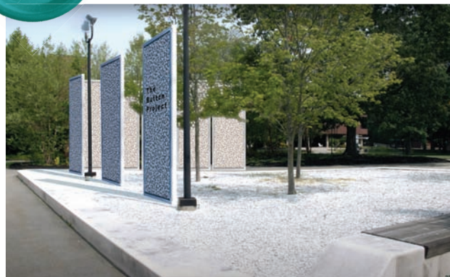
This artist rendering shows how the final installation will look.

Horn's installation will feature twelve double-sided, laminated glass panels supported by stainless steel frames. The buttons will fill the gaps between each set of clear panels, creating dotted vertical screens that will edge a courtyard on Bristol's Fall River Campus. The peaceful space will allow visitors to see every button up close and invite quiet reflection upon the enormity of human loss that the collection represents.